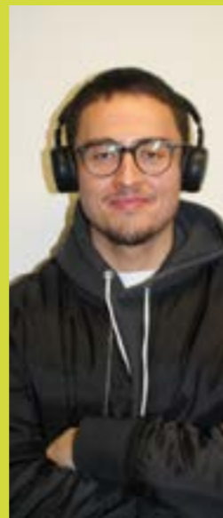
MAX PHOTOGRAPHER + WRITER