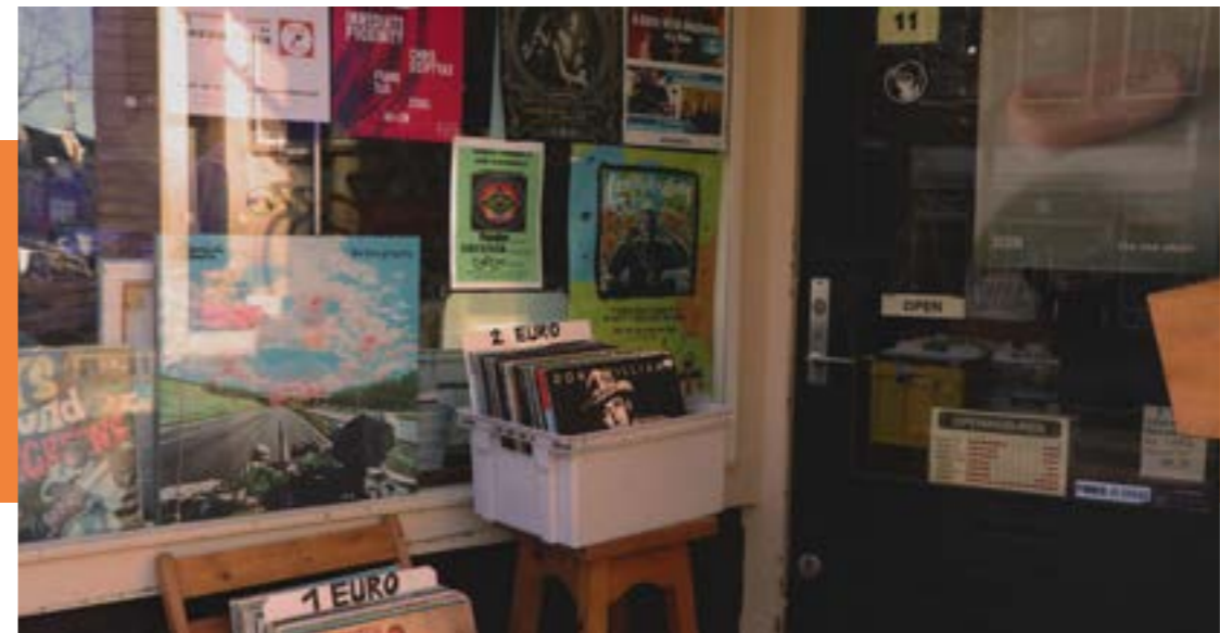
KING KONG RECORDS