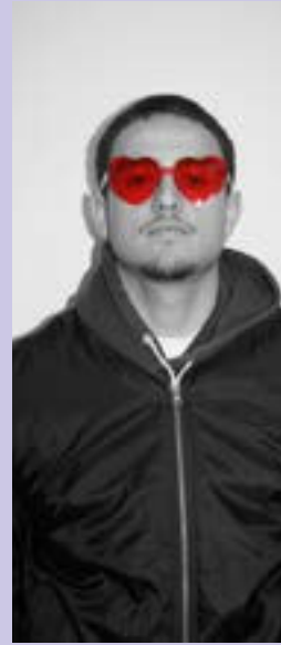
MAX PHOTOGRAPHER + WRITER