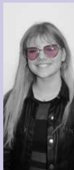
VIKTORIA PHOTOGRAPHER + WRITER