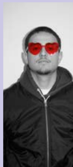
MAX PHOTOGRAPHER + WRITER